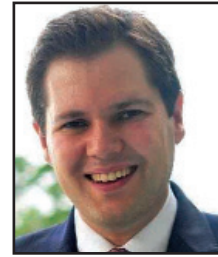
Robert Jenrick Newark