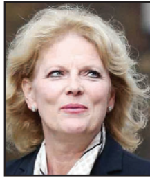
Anna Soubrey Broxtowe