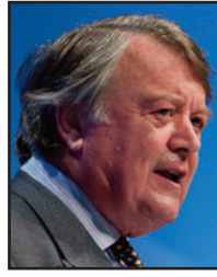
Kenneth Clark Rushcliffe