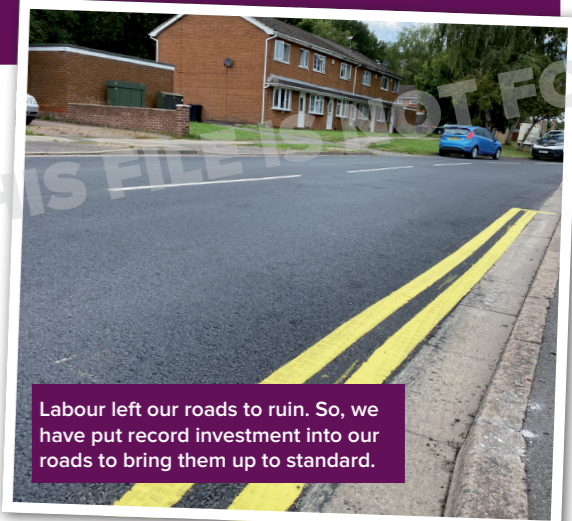
Labour left our roads to ruin. So, we have put record investment into our roads to bring them up to standard.