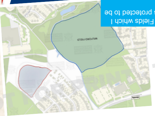
A plan of Wilford Fields which I want to ensure is protected to be enjoyed by all.

I know how important it is to protect our natural environment and I have set out in My Plan what I want to do to help protect Wilford Fields. I welcomed the planting of more trees on Collingham Way and along Lyme Park balancing pond. I want to see an increase in wildflower planting, a greater spread of new trees in open spaces but also along local roads.