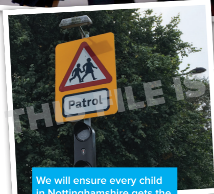
We will ensure every child in Nottinghamshire gets the best possible start in life.