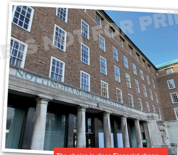
The choice is clear. Financial chaos under Labour. Or a high quality, value for money Conservative-led council.