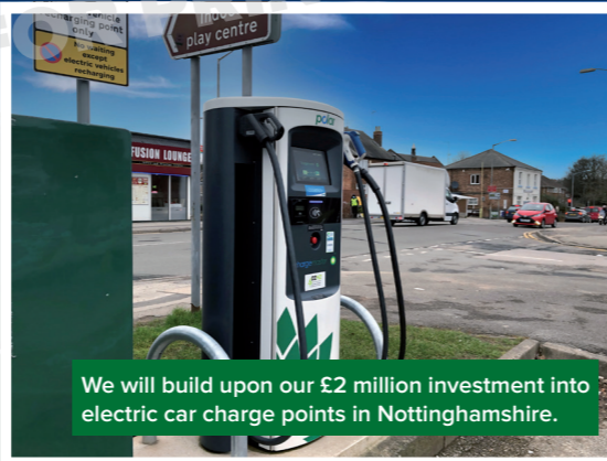
We will build upon our £2 million investment into electric car charge points in Nottinghamshire.