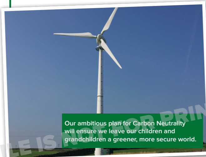
Our ambitious plan for Carbon Neutrality will ensure we leave our children and grandchildren a greener, more secure world.