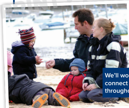
We'll work hard to better connect our diverse communities throughout Nottinghamshire.

Let's make Nottinghamshire an even better place to live. Vote Conservative on 6th May.